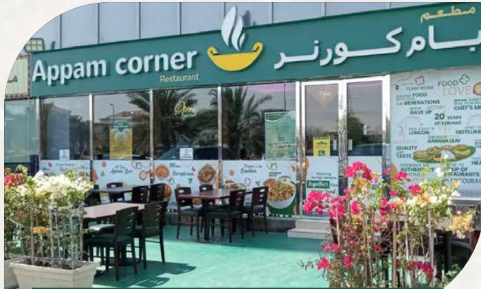
Dubai Investment Park - 1

Step into a warm, family-friendly ambiance, reminiscent of South Indian heritage.