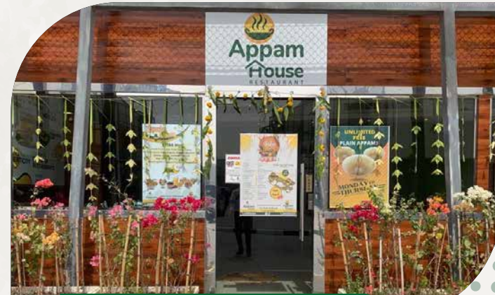
Dubai Silicon Oasis