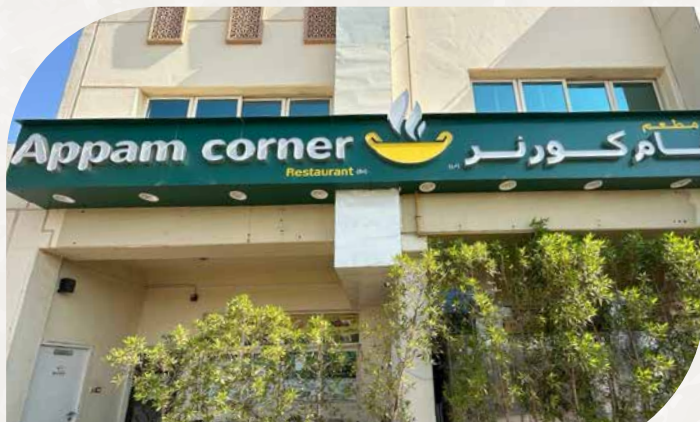
Dubai Industrial City